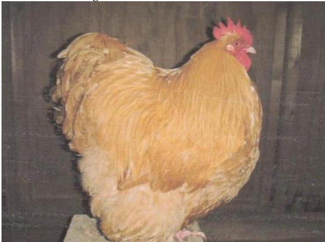
A Young Buff Ckl from our Patron