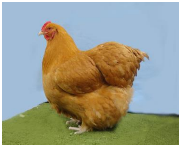
Figure 3 Ch Large Buff – Gold Feather Poultry