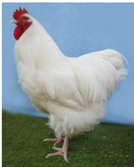
Ch Large White Sonya Ford