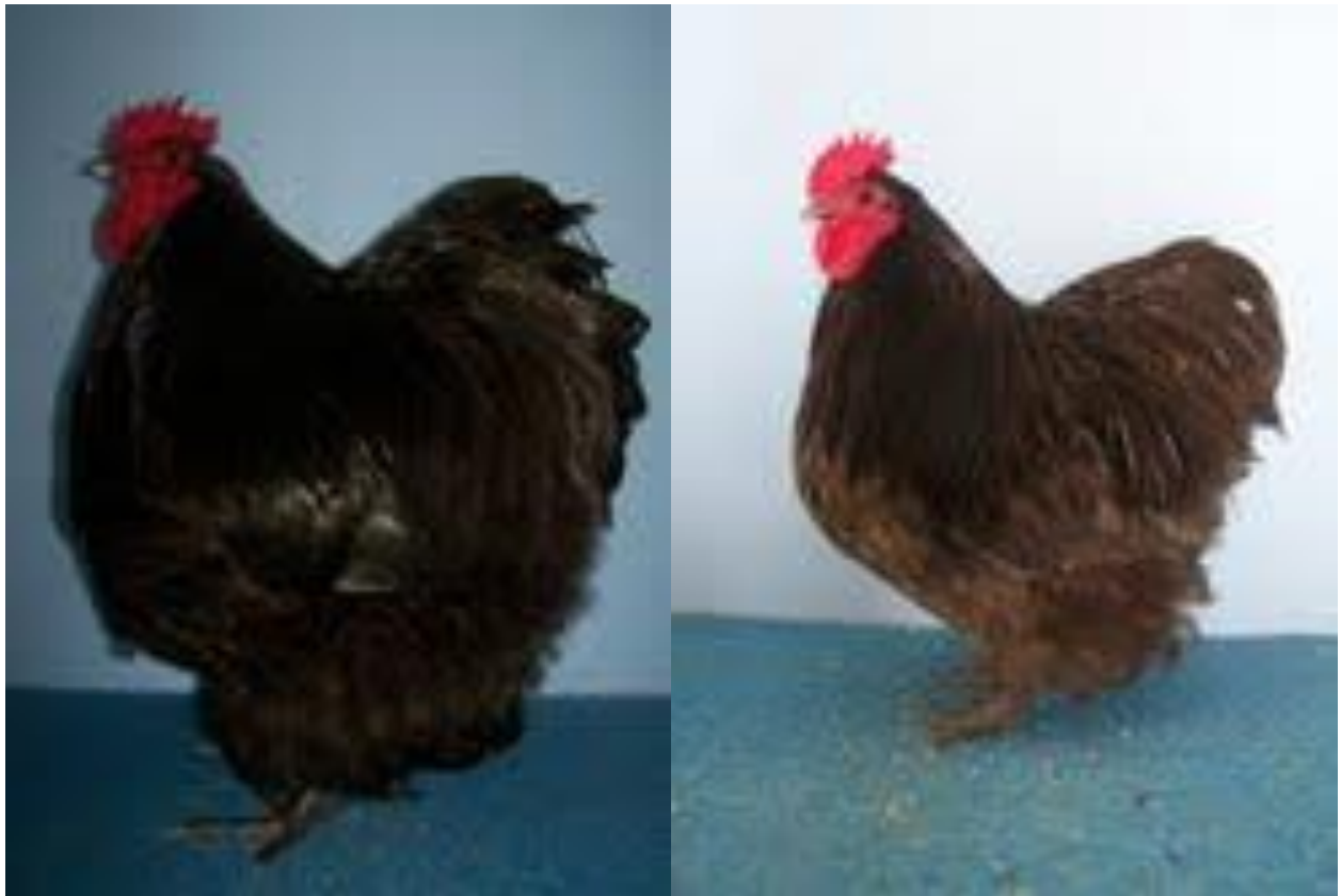
Figure 1 Ch Orpington @Dubbo PC Feature – Large Black Ckl shown by Chris Hardman