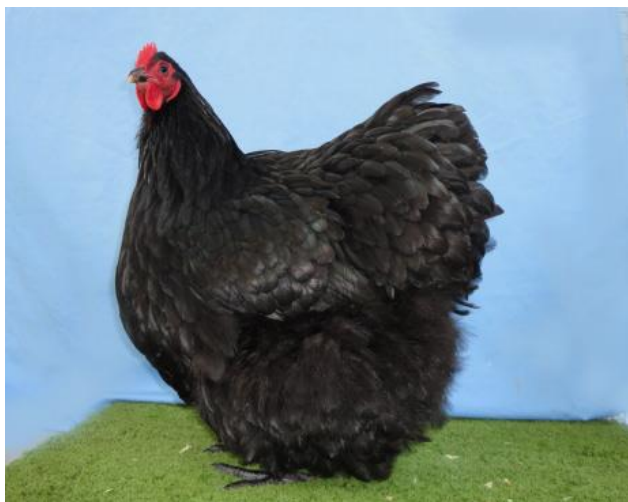
Ch Large Black – Pullet- Sonya Ford