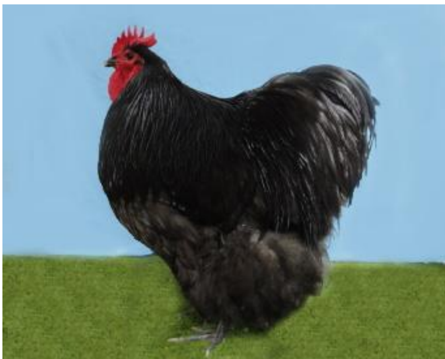
Champion Bird of Show at the 2013 Southern Feature Show Lloyd is a March 2012 hatched Large Blue Cockerel. He also went Reserve Champion Bird in Show at the 2013 National and Champion Bird of Show at Gippsland Riviera Poultry Club Annual Show (504 Birds) Beautifully bred, owned and presented by Vicki Jerrett

Established in 1985 the Orpington Club of Australia is dedicated to promote and protect this stately breed.