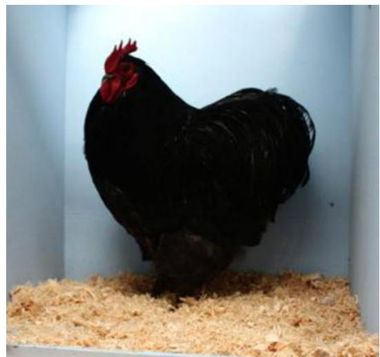
Champ Orpington Victorian Rare Breeds Show