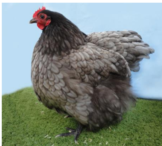
Ch Bantam Blue